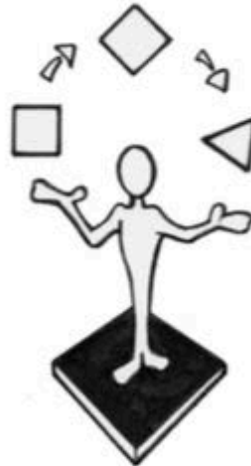
prototype toward a solution