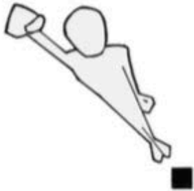
bias toward action