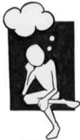
be mindful of process