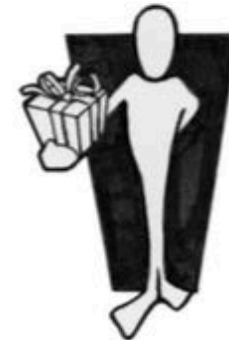
show don't tell